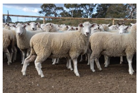
Oatleigh Pastoral, Millthorpe, NSW 250 ewe lms scanned twins, 58 kg, $ 250

There has been a lot of recent sales activity with ewe lambs being traded. Some recent notable sale follow. Don't forget to use the Cashmore Oaklea logo as the first photo in the listing. We think it has some market penetration.