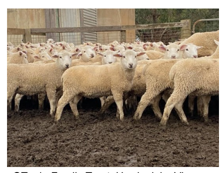
OToole Family Trust, Hawksdale, Vic 250 ewe Ims unjoined, 27 kg, $130

2021 Stud matings. The Cashmore Oaklea flock has a powerful genetic engine.