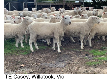
128 station mated ewe lms, 43 kg, $182